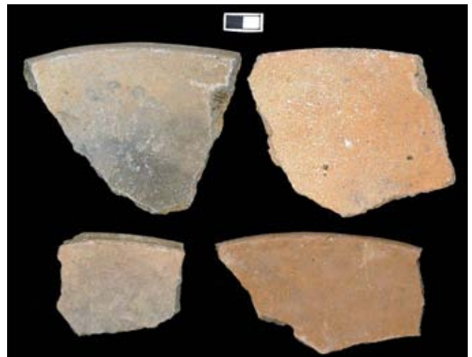
Figure 3. Comales , or tortilla griddles, from Pusilhá. This form is not found at Uxbenka or Lubaantun, suggesting that there were significant differences in food preparation practices within southern Belize during the Late Classic period.

from Pusilhá - with the exception of one vessel - lack connections to Honduras and El Salvador. This may in part be due to surface preservation; materials from Pottery Cave are remarkably preserved while ceramics from most other contexts at the site are not. An interesting feature of the Late Classic and Terminal Classic ceramic assemblage is the presence of comales (Figure 3). These are relatively common at Pusilhá and at sites in the Upper Pasion Region and the Dolores Valley to the west. They are not described for nearby Lubaantun, have not been found at Uxbenka (Andrew Kindon, personal communication 2007), and are generally uncommon, rare, or unknown in the northern Petén. The presence of comales at Pusilhá and in parts of the southern Petén may indicate that a distinct food-way was practiced in this region. Moreover, the marked difference in this regard between Lubaantun/Uxbenka and Pusilhá may indicate that in ancient times, identity in Toledo District was as complex as it is today.