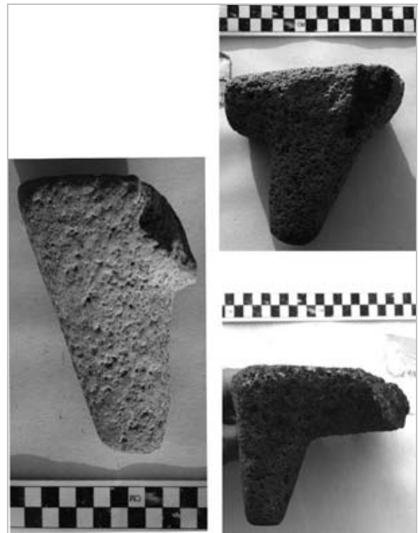
Figure 6. Footed metates from Pusilhá

from the volcanic highlands of Guatemala as finished artifacts.