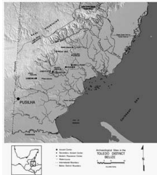
Figure 1. The Southern Belize “Region,” showing principal archaeological sites dating to the Classic period.